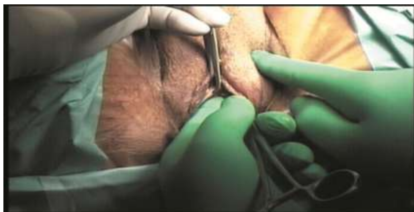
Fig 7. Evaluating Obturator foramen