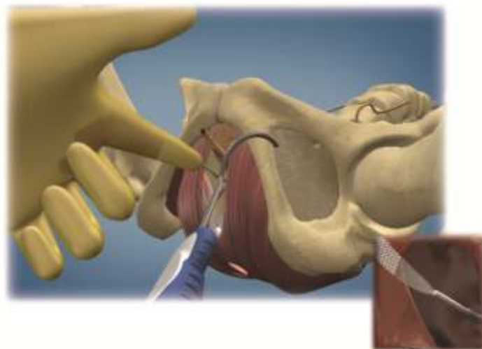
Fig 3. Manufacturer's Instructions on use of MONARC.