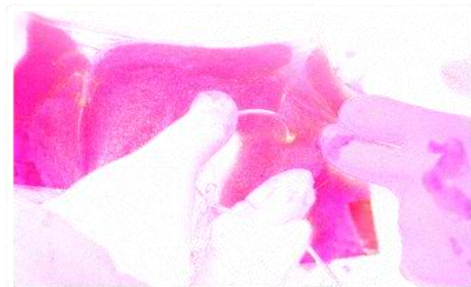
Fig 8. Introducing MONARC curved