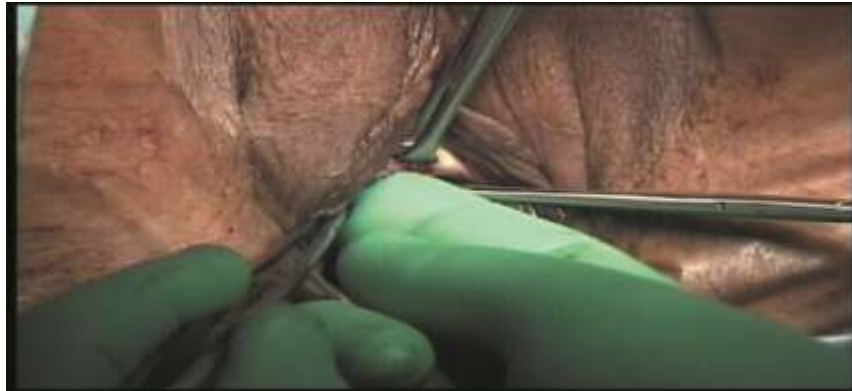
Fig. 6. Blunt Dissection