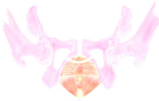
Fig 2. MONARC Curved