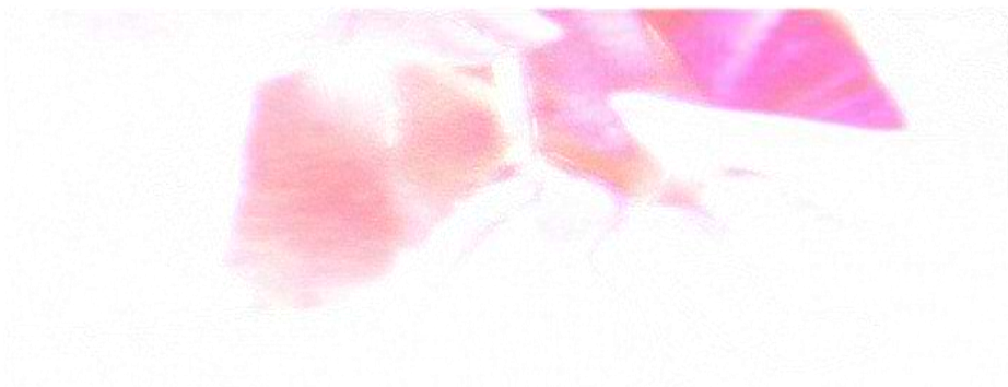
Fig 7. Evaluating Obturator foramen