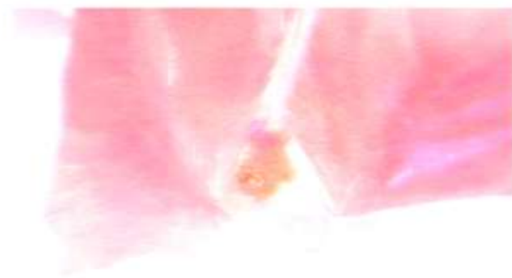
Fig 4. Vaginal Incision.