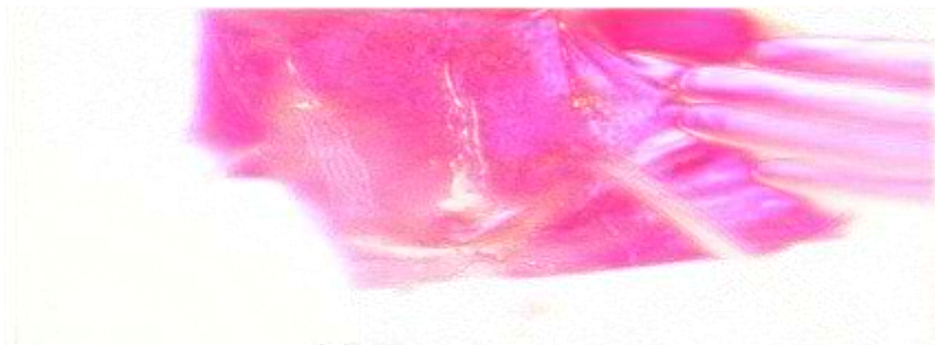
Fig 12. TOT ends trimmed