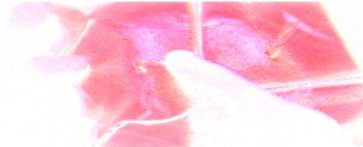
Fig 10. Similar TOT procedure on other side