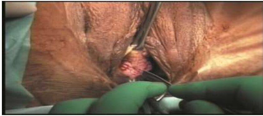
Fig 4. Vaginal Incision.