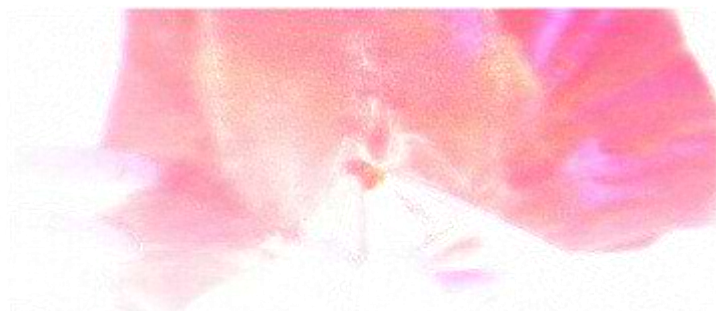
Fig 13. Vaginal wall sutured