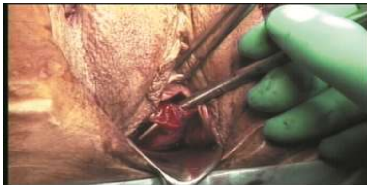
Fig 11. Tension adjusted