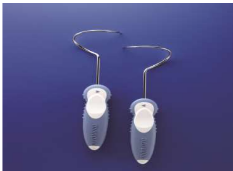
Fig 2. MONARC Curved