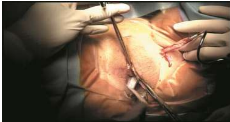
Fig 09. Both ends of the tape identified