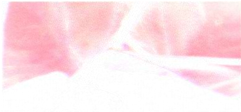
Fig. 6. Blunt Dissection