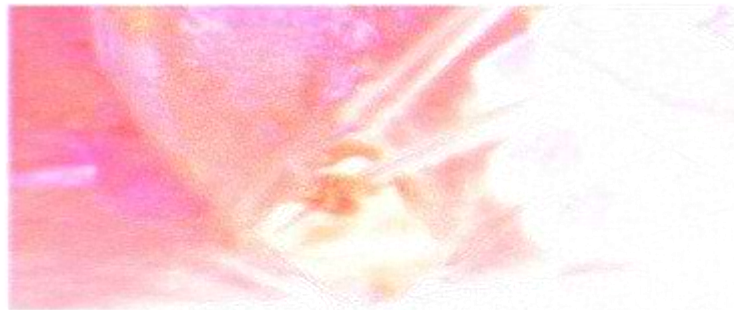
Fig 11. Tension adjusted