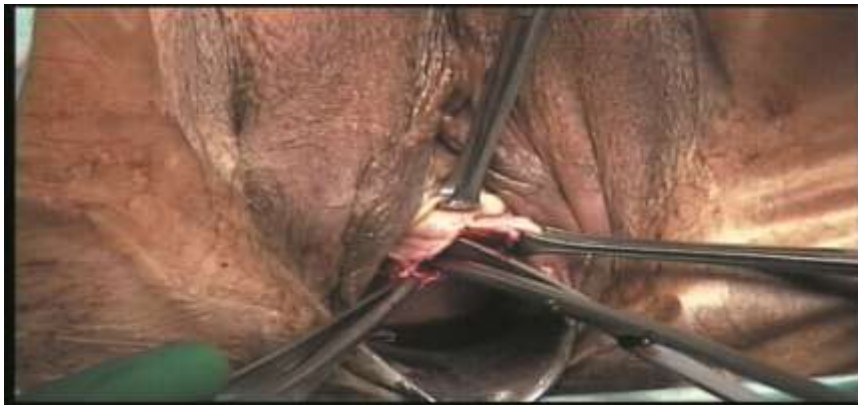
Fig 5. Sharp dissection