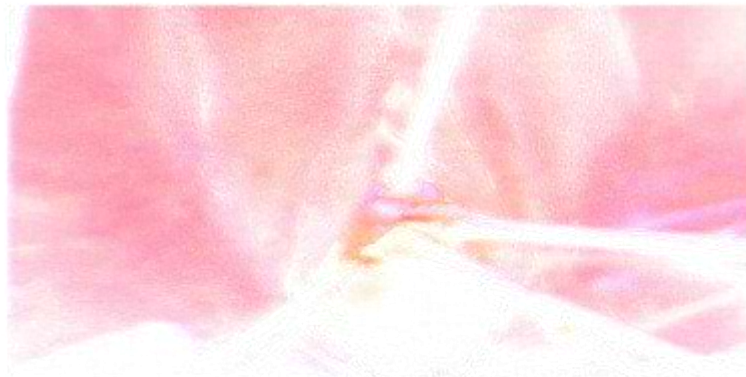
Fig 5. Sharp dissection