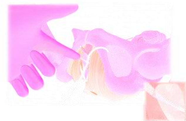
Fig 3. Manufacturer's Instructions on use of MONARC.