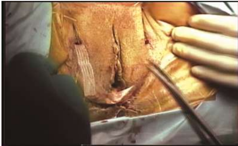
Fig 12. TOT ends trimmed