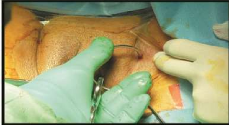
Fig 8. Introducing MONARC curved