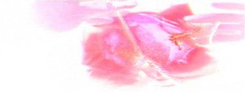
Fig 09. Both ends of the tape identified